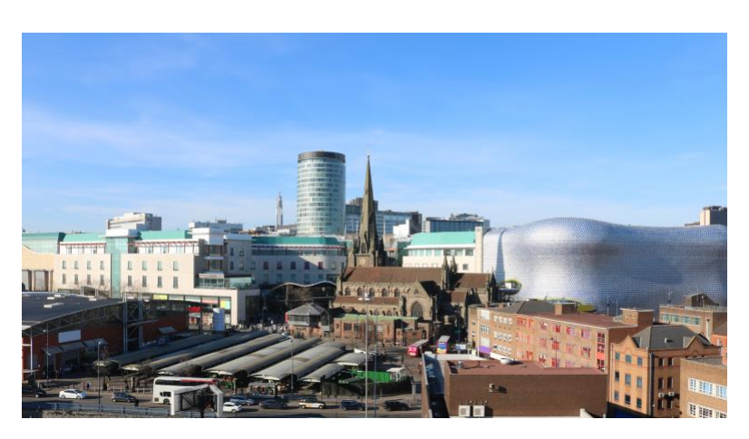
This image is utilised with a standard image licence.

This decision is difficult. In respect of the correctness of Parshall , it is welcome and clearly right. The very essence of relative title is that it is possible for two titles to exist in relation to land simultaneously. The adverse possessor obtains a title as soon as they go into possession. Thus, an adverse possessor is always in possession of 'their own' land. It should make no difference to their relationship vis-à-vis another