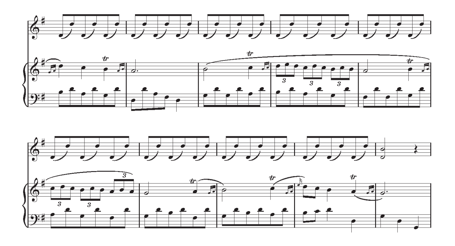
Example C: Mozart, Violin Sonata in D major, K. 306